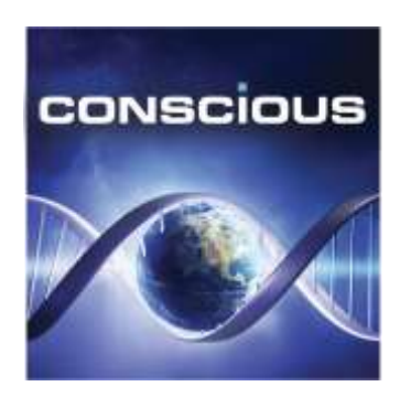
Specialised Management and Leadership Services